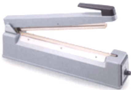
KF-520H (2.6mm) KF-525H (5mm)

Impulse hand sealers seal poly bags and other thermoplastic materials quickly and efficiently without any warm-up time. Depending on the model of the machine, material up to 16" wide and 10mil total thickness can be sealed. The sealers are equipped with a plug-in electronic timer which controls the different sealing times needed for different materials' varying thickness. The timer automatically beeps when the seal is done. Once the timer is set, the sealer will give a consistently flat seal. It is recommended that the user hold the seal bar down for a few seconds more after the light goes out to ensure enough time for the seal to cool and set.