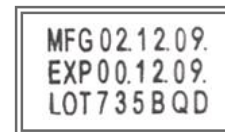
Printing Sample (actual size)