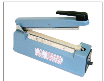
8", 10mm, 1000w, 14lbs.

The machine will seal material up to 8" wide & 10 mil or more in total thickness. The seal width is 10mm (3/8").